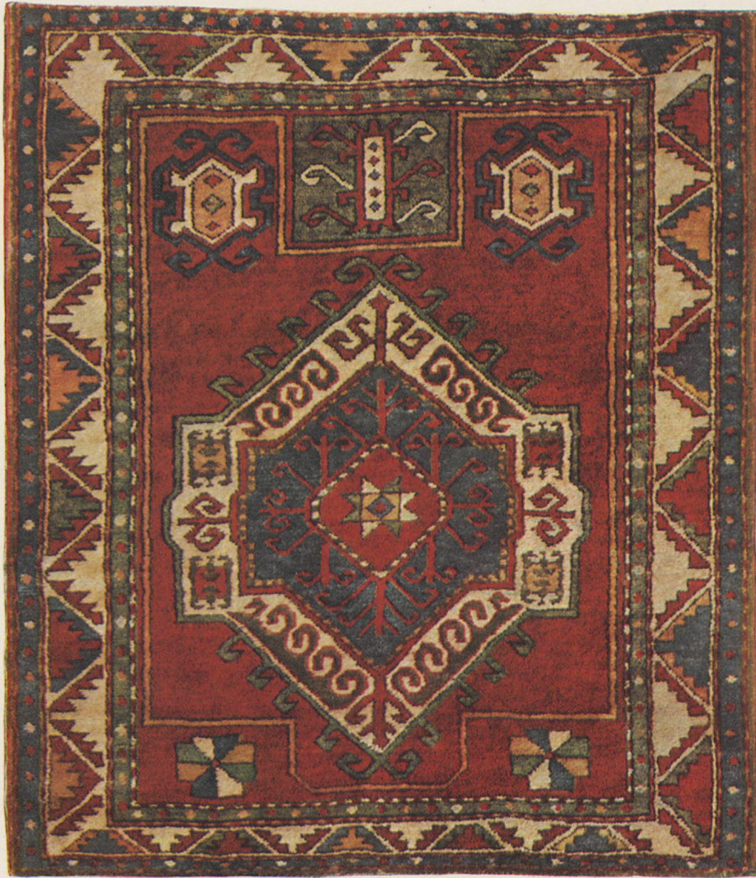
Plates by The A. E. Woll Photographic Co.

Warren's Cameo Plate Ivory White 25 x 38—90 See last page for sizes and weights stocked