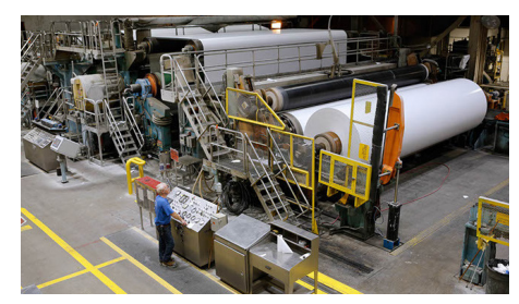
Paper Machine 2 at Somerset Mill

All of Sappi North America's US-based coated paper and packaging mills are triple-certified in accordance with the leading global sustainable forestry Chain-of-Custody certification systems, including the Forest Stewardship Council® (FSC®-Co14955), the Sustainable Forestry Initiative® (SFI®) program, and the Programme for the Endorsement of Forest Certification (PEFC/29-31-10). Product certifications are available upon request, pending availability of credits. The producing mill is ISO 9001, ISO 14001, and ISO 45001 certified.